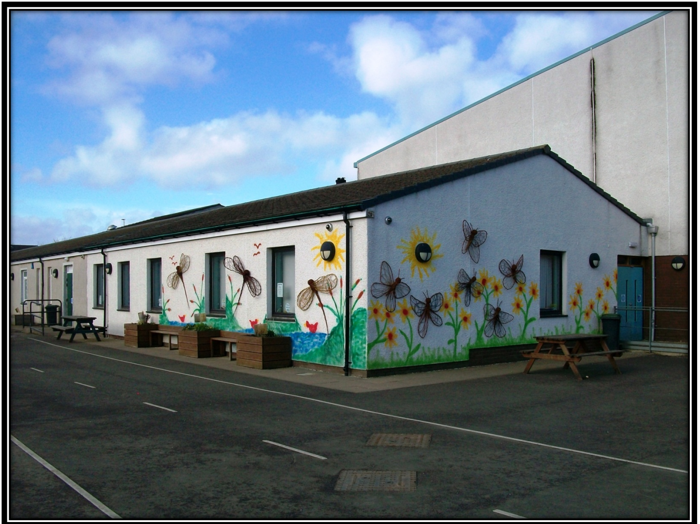
P.1 Entrance at the rear of the school

An Administrative Assistant, Clerical Assistant, Pupil Support Workers, Facilities Management Assistants, Kitchen Staff and Cleaning Staff all fulfill important roles in the Bankton Learning Community and are instrumental to the smooth running of our school.